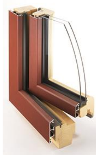
Figure 3: The impregnated and coated timber is covered by an additional aluminium cladding on the exterior side