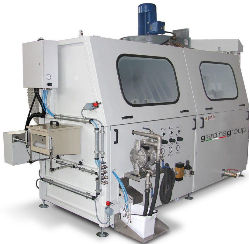
Figure 1: Example of a FlowLine impregnation machine

The impregnation process of timber products is handled with care by window and door manufacturers and is carried out on finished components mostly in closed systems with water-based impregnation and reuse of excess liquid in a closed system 5 . Other uses and working conditions are described in the assessment documents.