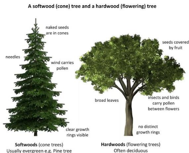
Figure 4: Distinction between Softwood and Hardwood trees