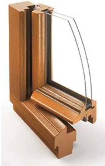
Figure 2: The outer 1-3mm of the Timber profile contains impregnation product, which is covered by a Topcoat of 100-150 µm

The figures below show typical constructions of a timber and a metal-clad timber windows, which includes a protection coating on the timber frame and sometimes additional metal cladding.