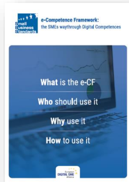
The SME guide for the implementation of ISO/IEC 27001 on information security management and a guide on e-Competence Framework

Lastly, SBS significantly gained confidence among the Twitter audience as it engaged more actively than ever before, resulting in an impressive increase in the number of followers.