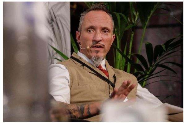
SBS annual conference "European Standardisation Regulation - 5 years on. What has changed for SMEs?" in the Solvay Library