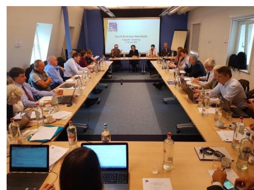
The SBS experts' meetings were held in Brussels on 15 February and 11 October