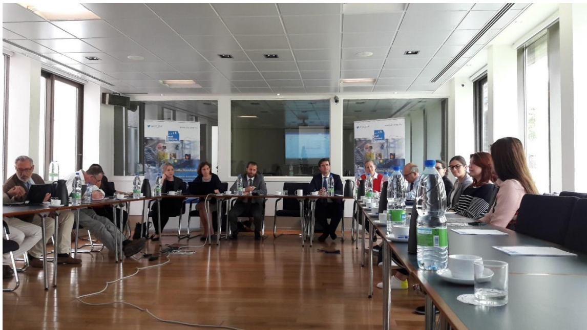
SBS IPR-based standardisation training on 29 June in Brussels

The first training session intitled "Training on Intellectual Property Rights-based standardisation" was organised in Brussels to inform and raise awareness about the high strategic importance of Intellectual Property Rights for the European economy.