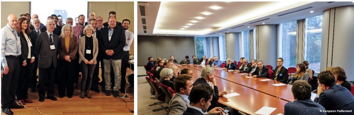
SBS experts' meetings were held in Brussels on 13 April and 18 October 2016

SBS experts gathered in Brussels on two occasions during the year, in April and October 2016.